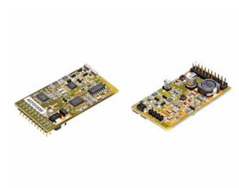
Figure 4: AX-210XS