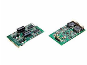
Figure 2: AX-210S