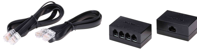
Figure 5: SP400